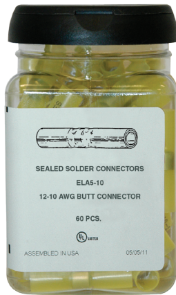
Sealed Solder Connectors