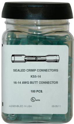
Sealed Crimp Connectors