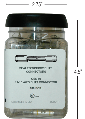
Sealed Window Butt Connectors