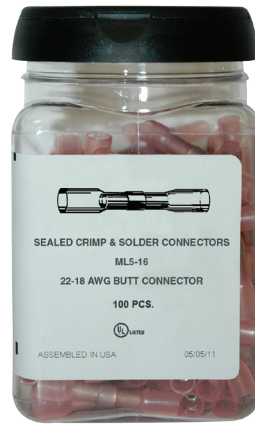
Sealed Crimp & Solder Connectors